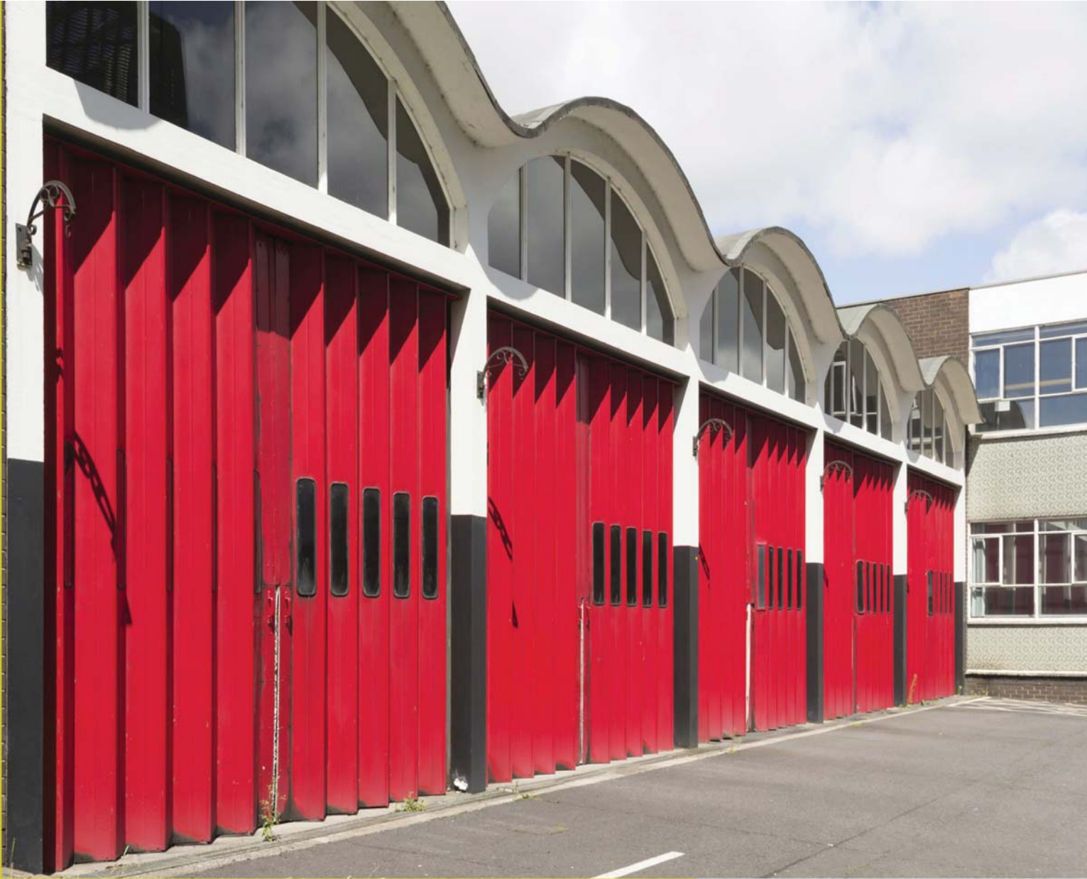
Foldaside 340 Commercial Sliding & Folding Door Systems