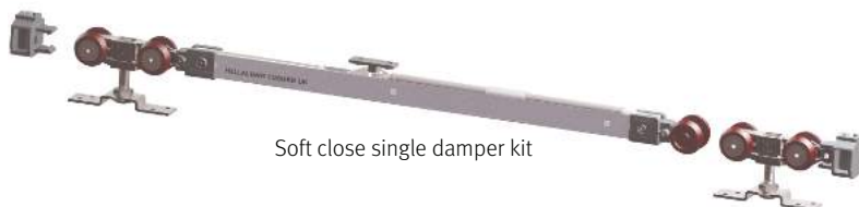
Soft close single damper kit