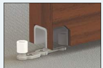
Adjustable rattle proof floor guide