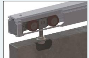
Soffit fixed track c/w hanger for metal doors