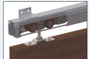
Wall fixed track c/w hanger and apron plate for timber doors