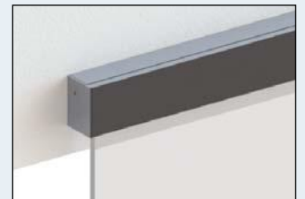
Track c/w cover profile and end caps