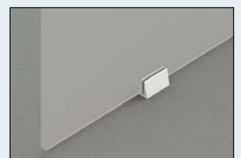
Glass floor guide