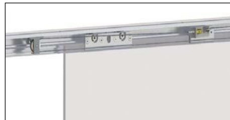
Synchro mechanism and clamp retrofitted into track