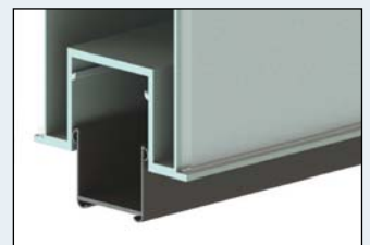
Expandable seal recessed into bottom of door