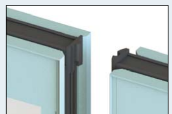
Double glazed interlocking edge profiles