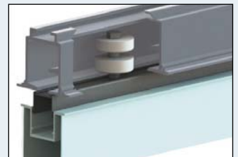
Twin point track c/w hanger