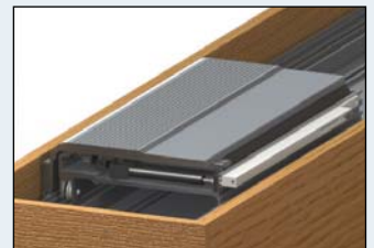
Top rail with R/H sliding unit c/w soft closers (door closed)