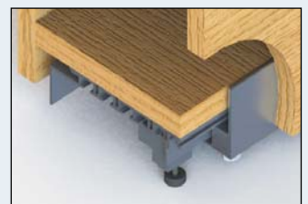
Bottom rail with sliding unit