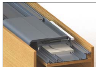
Top rail with R/H sliding unit c/w soft closers (door open)