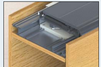
Top rail with L/H sliding unit c/w soft closers (door closed)