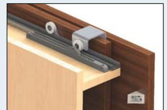
Aluminium top rail c/w soft closers