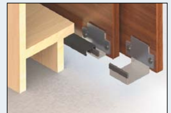
pvc bottom rail