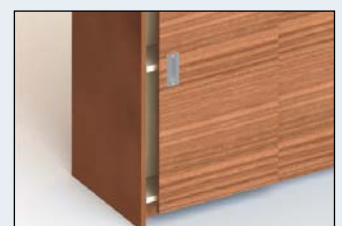
Recessed flush pull handle