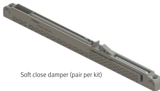
Soft close damper (pair per kit)