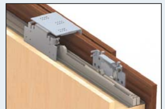
Aluminium top rail c/w soft closers