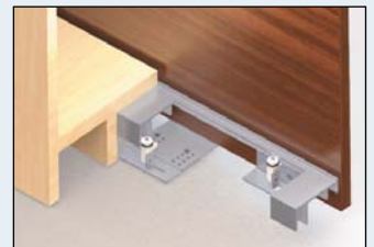
Aluminium bottom rail