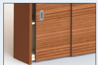
Recessed flush pull handle