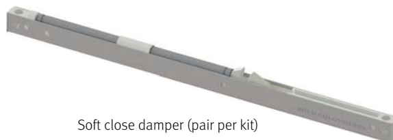
Soft close damper (pair per kit)