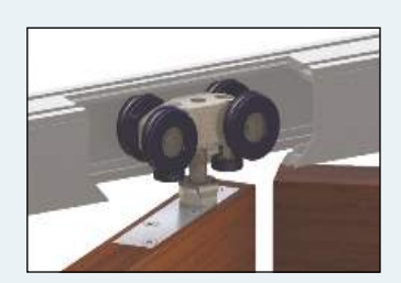
4 wheel intermediate hanger